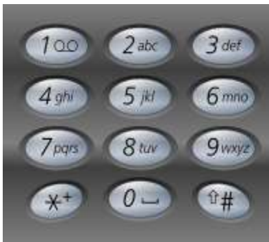
Figure 1.1A standard modern telephone keypad, as used for text messaging .