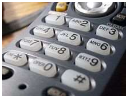
Figure 1.2 A standard telephone keypad.

Note that the layout of the digits is different from that commonly appearing on calculators and numeric keypads. The "*" is called the "star key" or "asterisk key". "#" is called the "number sign", "pound key", or "hash key", depending on one's nationality or personal preference. These can be used for special functions. For example, in the UK, users can order a 7.30am alarm call from a British Telecom telephone exchange by dialing: *55*0730# . Most of the keys also bear letters according to the following system: